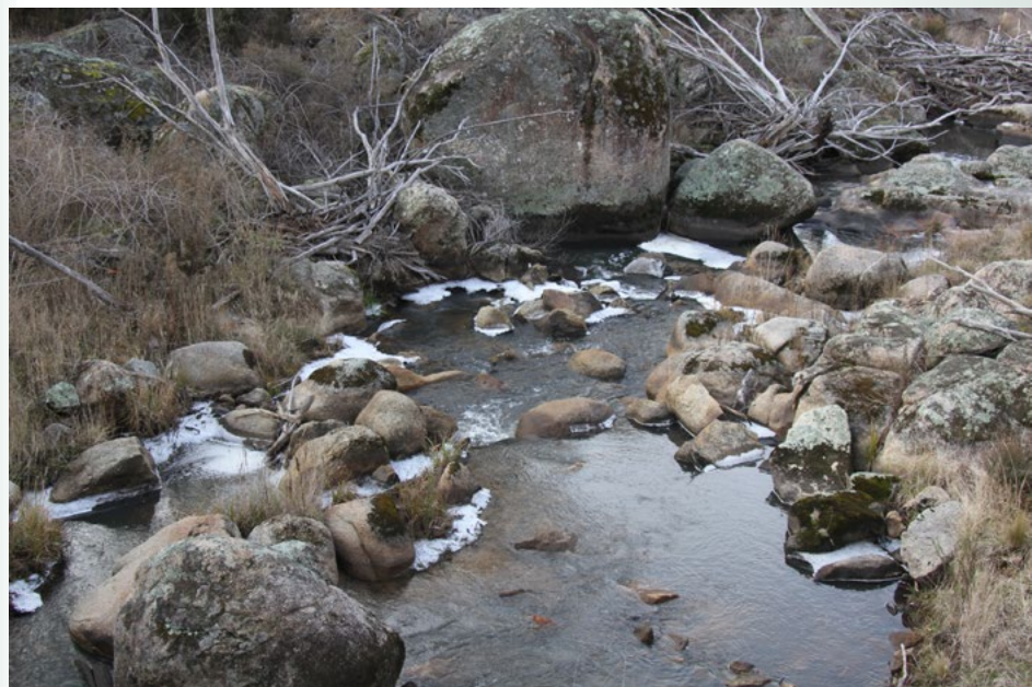
Snow and ice in the Guthega River returning from the July outing.