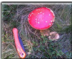
For scale, the folded saw is 23.5 cm

As Brian Slee, our work party leader commented, the weather was fine and chilly and the light superb, especially filtering through the yellowing leaves of the deciduous larches. Mountain peppers bore plump berries.