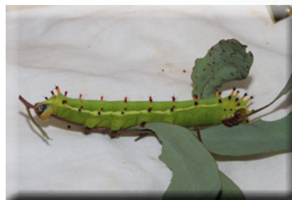
The very hungry caterpillar Emperor Gum moth larvae