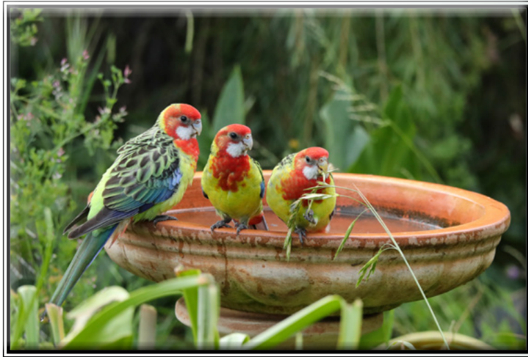
Food and a drink