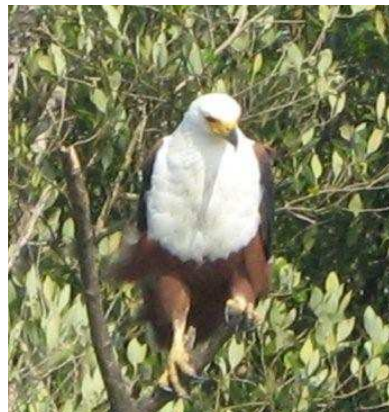
African fish eagle ( Haliaeetus vocifer) Noted for being very vocal

Monthly meeting venue: Division of Botany and Zoology, Building 116, Daley Rd, Australian National University. Park (occasionally the adjacent building 44). Meetings start at 7:30 pm and are followed by refreshments.