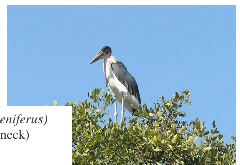
Marabou stock ( Leptoptilos crumeniferus ) Note the fleshy pouch on the foreneck