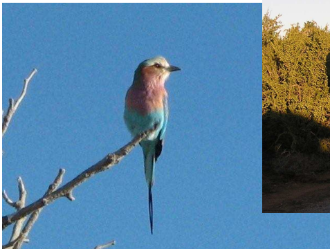
The lilacbreasted roller ( Coracias caudatus ) Related to king fishers rollers like to sit up on trees. The sexes are alike in colouration.