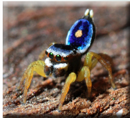
Maratus hesperus discovered at Mt Majura vineyard 2013